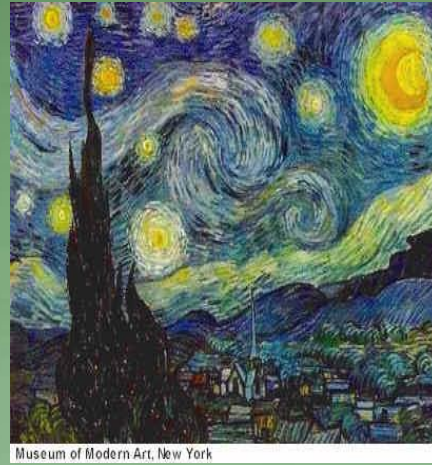
Museum of Modern Art, New York