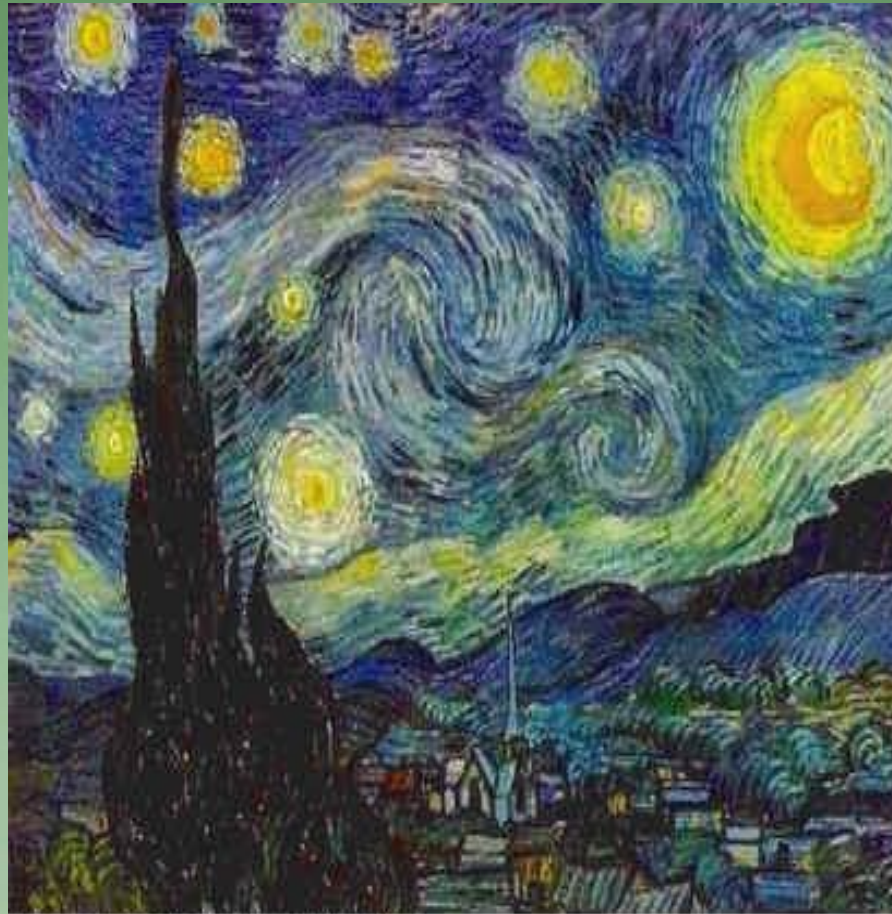
Museum of Modern Art, New York